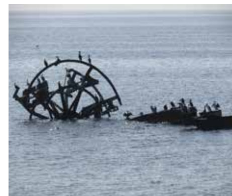
The Ozone at Indented Head, 2012

A stark rusted paddle-wheel marks the wreck of the Ozone off-shore at Mel 460 B1. This 85 metre paddle steamer had a famous career bringing holiday-makers 'down